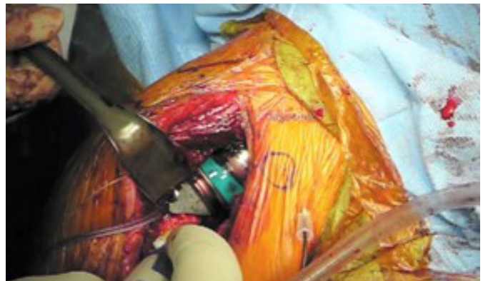
Figure 1. In this rTSA, the Checkpoint stimulator is used to check the axillary nerve after placing the trial components. The “threshold stimulus” should not increase and, if it does so, overstretching of the axillary nerve must be suspected.

It is our practice to routinely use the Checkpoint® stimulator to identify and check the axillary nerve. If 0.5 mA does not produce a strong contraction, we perform an external neurolysis and test again. Consistently, in the absence of a more serious injury to the nerve, incising or stripping the thickened epineurium improves the function and a strong contraction in the 0.5 mA range is achieved.