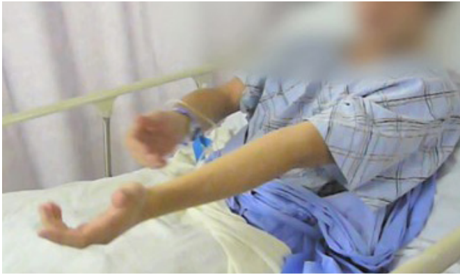
Figure 2. This patient suffered damage to the musculoskeletal nerve after a Latarjet procedure with inability to flex the elbow.