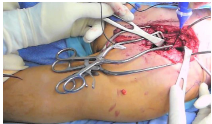
Figure 4. The nerve response is tested at 2.0 mA and then again at 0.5 mA. In this patient, the good contraction observed at 2 mA indicates that there will be at least partial recovery, while the weak response at 0.5 mA indicates near complete recovery will occur.

lesion and a response could be observed in the elbow flexors in the 2.0 mA range. From this finding, we can infer that the patient will recover at least antigravity elbow flexion and that neurolysis, rather than grafting or Oberlin transfer, is indicated. After further dissection, the nerve is tested again and a